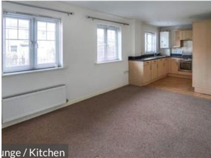
Living room / Kitchen